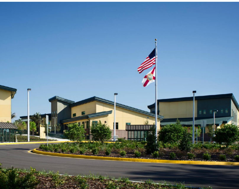
Spring Hill Campus