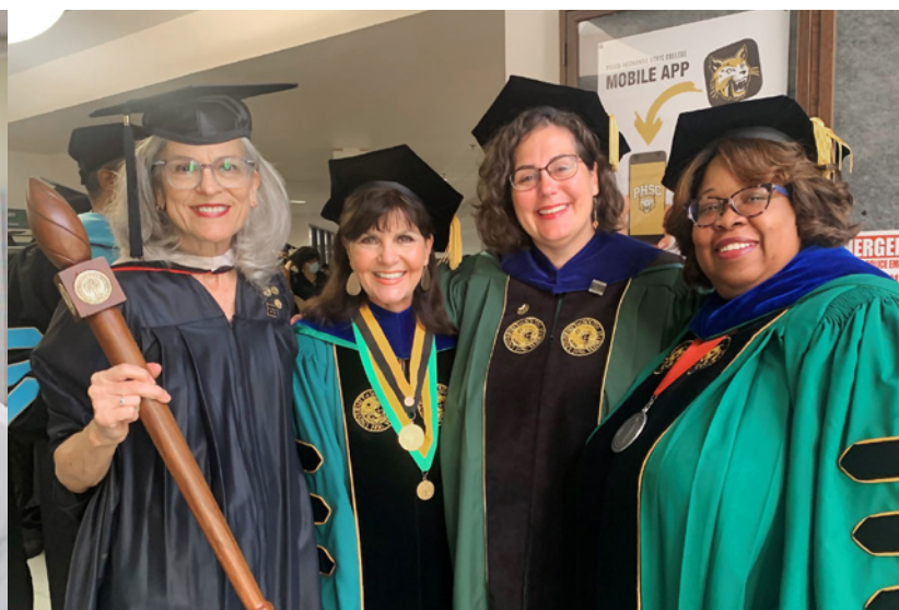
Faculty proudly participate in commencement ceremonies.