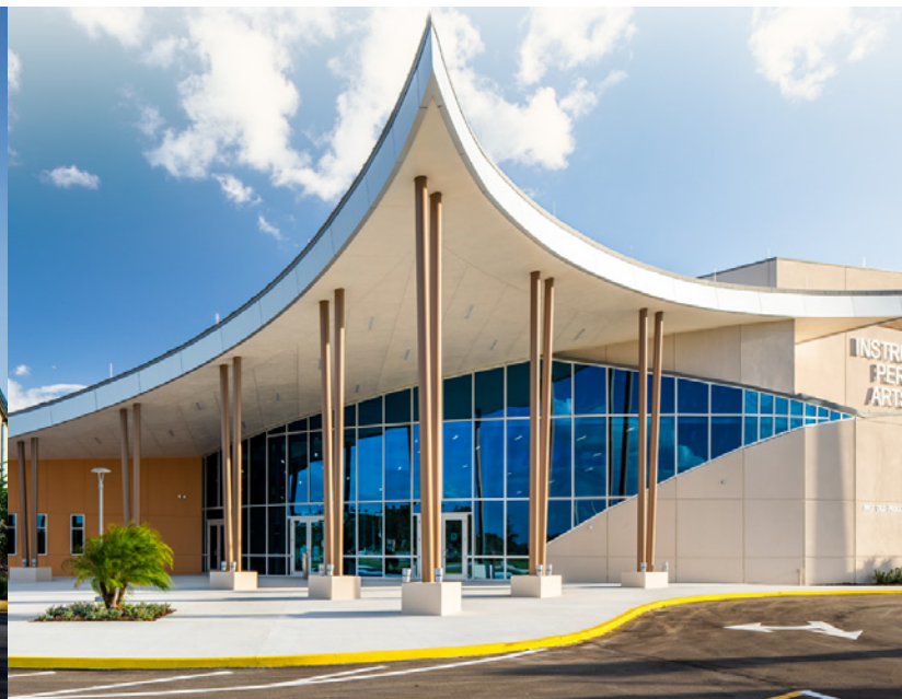
Instructional Performing Arts Center, Wesley Chapel

PHSC subscribes to and endorses equal employment and educational opportunity. Its policies and practices will assure nondiscriminatory treatment of all persons without regard to race, color, age, national origin, religion, marital status, gender, gender identity, sexual orientation, disabling condition, ethnicity, pregnancy, or any other factor or condition protected by law. In addition, the College shall not solicit, collect, maintain, or utilize genetic information, as defined in Federal regulations for any purpose. PHSC makes every reasonable effort to accommodate persons with disabilities.