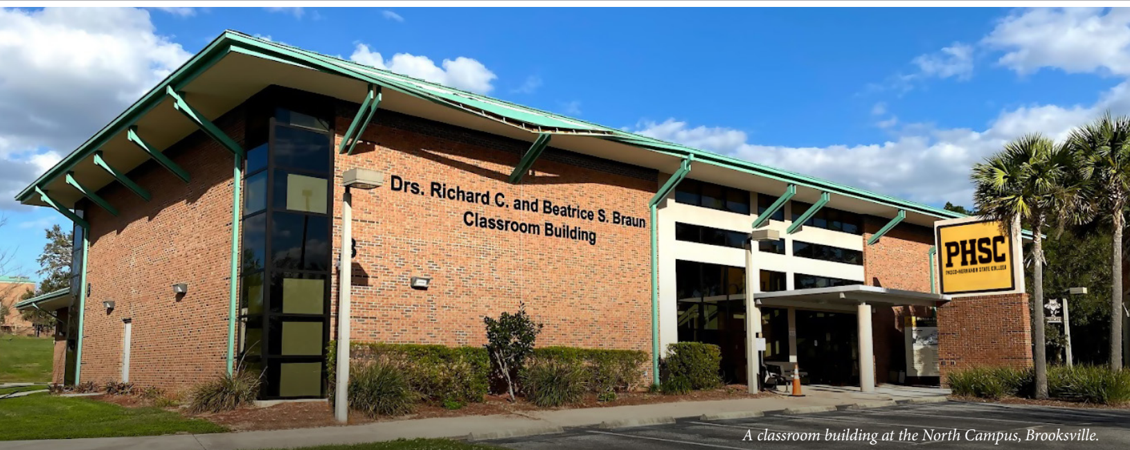
A classroom building at the North Campus, Brooksville.