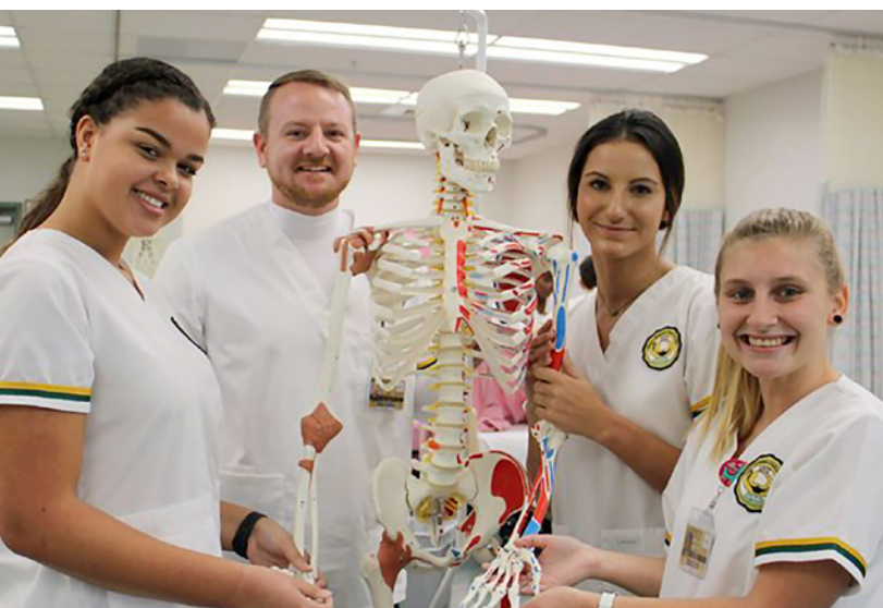
Health program students interact with "Bones."