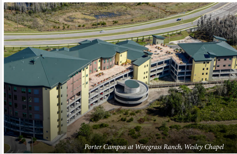
Porter Campus at Wiregrass Ranch, Wesley Chapel

Approved by the DBOT, the College's Strategic Plan outlines the College's goals through 2024. This comprehensive publication sets the agenda as the College builds upon and brings focus to what PHSC currently does well and will do well in the future. The strategic plan is available at https://tinyurl.com/2p5zhm5p .